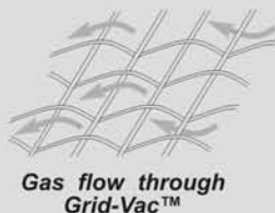
Gas flow through Grid-Vac ™

Grid-Vac ™ Sample Bags are made-to-order to your dimensions and specifications. Our bags are all double heat sealed and are all individually leak checked by our technicians. Grid and internal fittings may be returned for re-manufacture or re-skinning to Sampling Bag Technologies, LLC (SBT)